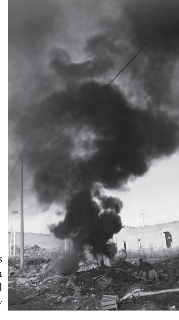
Texas Commission on Environmental Quality